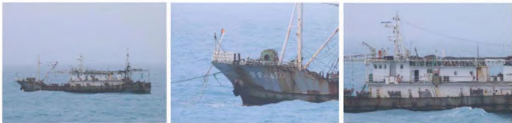
g. Photographs - Photos taken at 10:46 on July 15, 2020