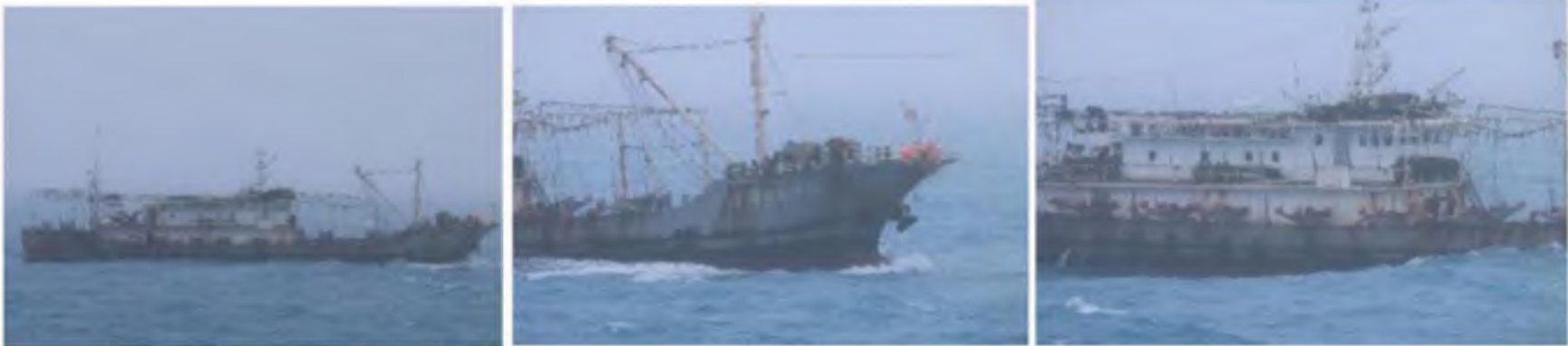
g. Photographs - Photos taken at 10:15 on July 15, 2020