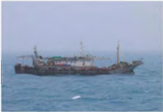
g. Photographs - Photos taken at 11:14 on July 15, 2020