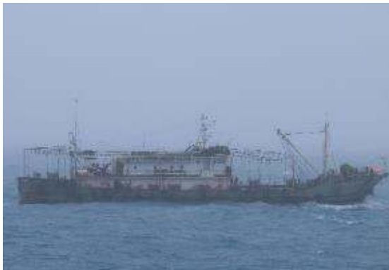
g. Photographs - Photos taken at 10:15 on July 15, 2020