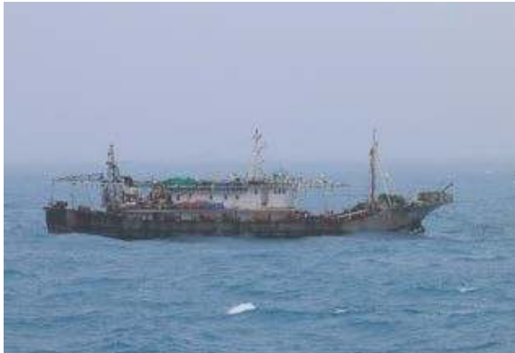
g. Photographs - Photos taken at 11:14 on July 15, 2020