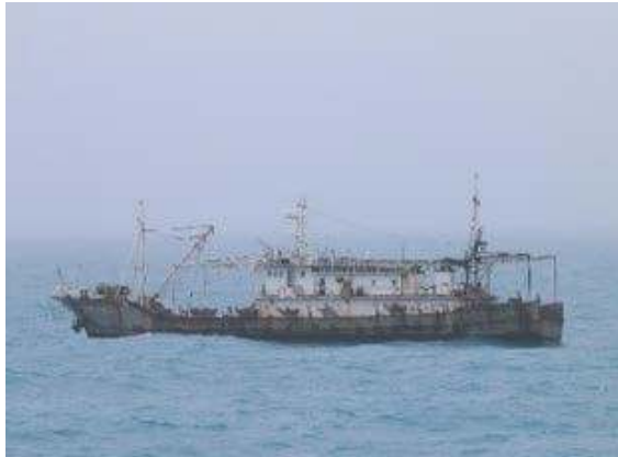
g. Photographs - Photos taken at 10:46 on July 15, 2020